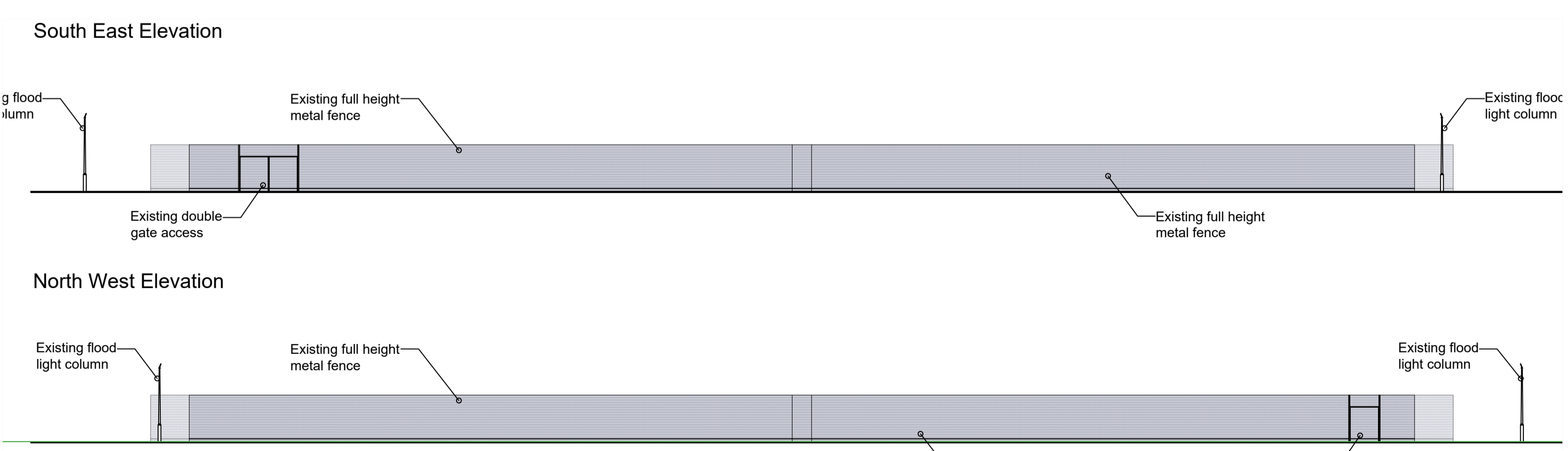
Existing Elevations Scale 1:200 @ A1